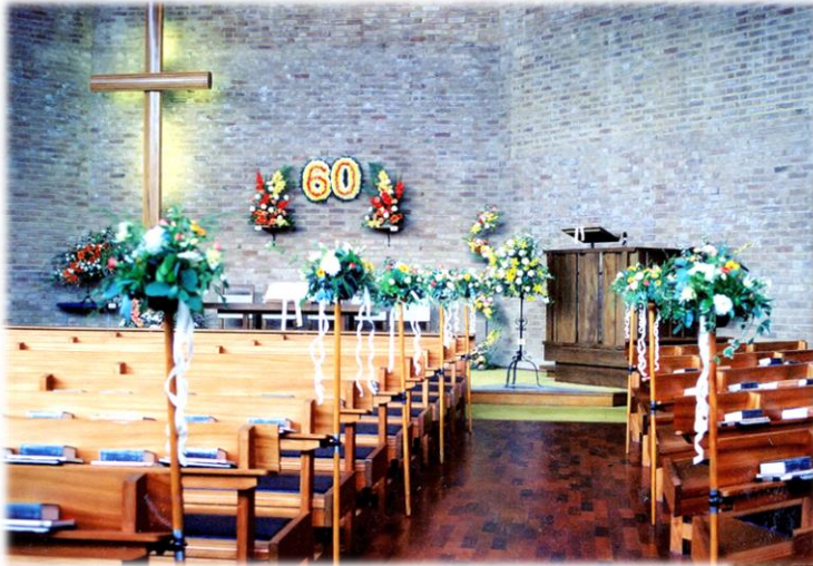
Looking through the archives for Janet's Page-1 message, we found these as well.